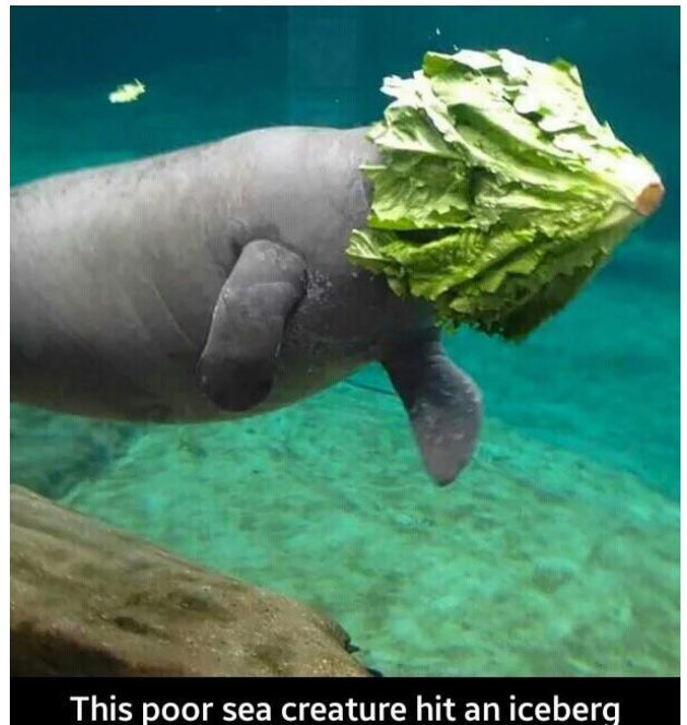
This poor sea creature hit an iceberg